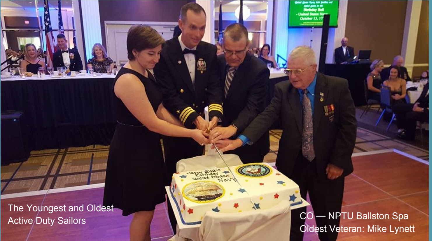
The Youngest and Oldest Active Duty Sailors