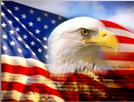
Right: Mike Lynett participated in the cake cutting ceremony as the oldest Veteran.