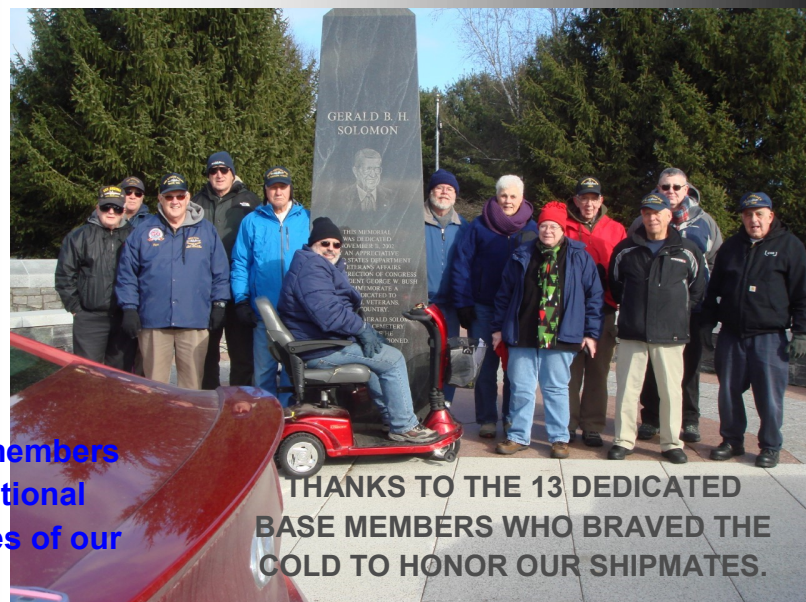
THANKS TO THE 13 DEDICATED BASE MEMBERS WHO BRAVED THE COLD TO HONOR OUR SHIPMATES.