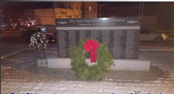
Our Shipmates were remembered by the base members at the Submarine Memorial and the Saratoga National Cemetery by placing 16 wreaths at the gravesites of our shipmates on eternal patrol.