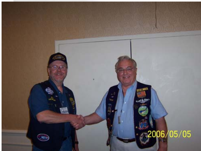
Pride Runs Deep