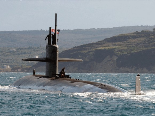
USS MEMPHIS SSN-691

were recognized by being awarded the Battenburg Cup. This is an award given to the best Ship or Submarine in the entire Atlantic Fleet. This honor has only been given to a Submarine Crew one other time. So to all of our Shipmates onboard USS MEMPHIS (SSN 691), congratulations on your accomplishments as a team. You are definitely our Crew in the Spotlight.