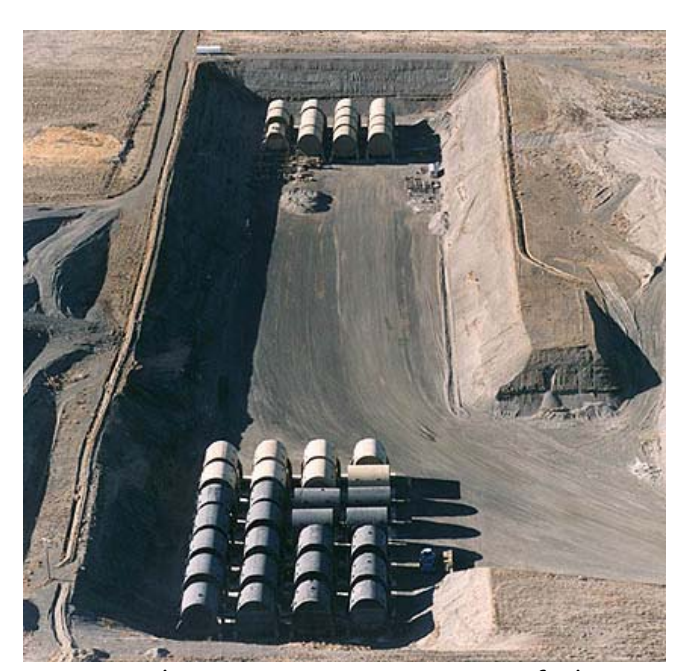
In 1986 the reactor compartment of the ex-USS Patrick Henry SSN 599 became the first on placed in Trench 94. Once full, the trench will be filled with dirt and buried. The compartments are expected to retain their integrity for more than 600 years.

Did you ever wonder how they dispose of the reactor compartment of a recycled US Naval Submarine? After decommissioning the boat enters a dry dock and the center section (the Reactor Compartment) is removed and the unused fuel is recovered. After de-fueling, the Reactor Compartment is treated like low level waste (LLW in Radiological contamination terminology) It is handled differently than the rest of the boat. Since it is radioactive waste, and now separated from the ship, it leaves the dry dock, and is not recycled. It is transported by a series of special vehicles to the Hanford Reservation, a 500 square mile facility located northwest of Richland, WA. Here the reactor compartments are brought to an area of the Hanford Reservation designated 200 East and eventually placed in a disposal trench called Trench 94.