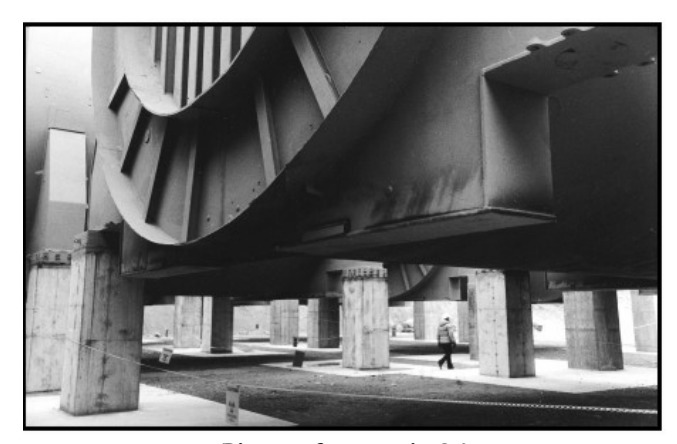
Floor of Trench 94