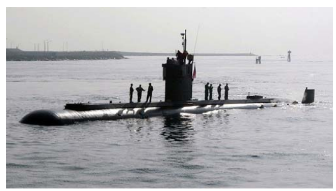
USS Dolphin (AGSS -555)

The submarine was commissioned in 1968 and is the sixth oldest ship in the fleet. Dolphin was designed for research, development, test and evaluation and is one of the world's deepest diving submarines with a maximum operating depth in excess of 3000 feet.